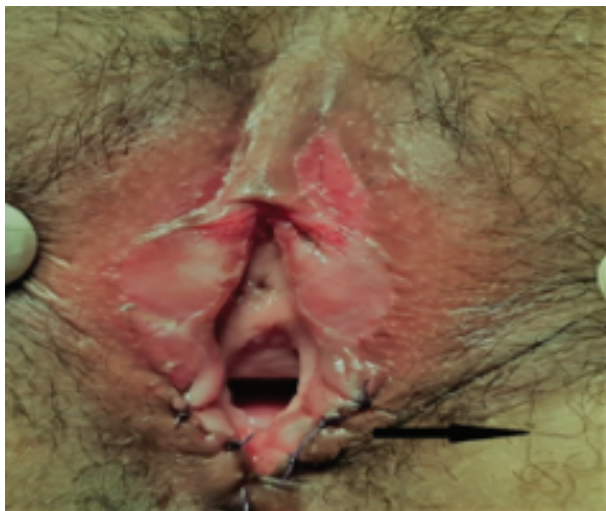
Fig. (3). Black Arrow: Margins Everted and Sutured with Vicryl 3/0.