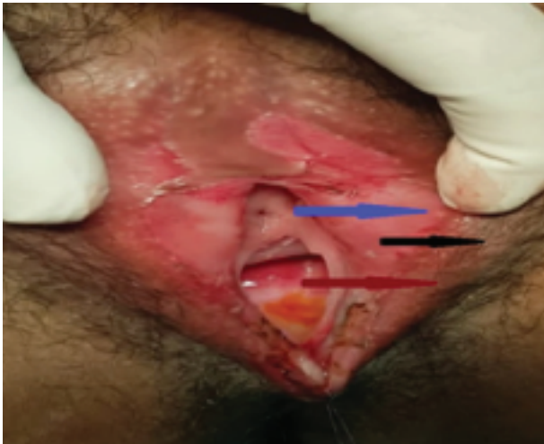
Fig. (2). Blue Arrow: Urethra, Black Arrow: Labia Minora, Red Arrow: Vagina.